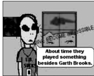
ALIEN RESPONSE TO NINETI