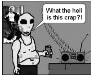
ALIEN RESPONSE TO SETI

Other organizations, like SETI (Search for Extraterrestrial Life, no relation to NINETI) try to contact alien beings by sending out binary code (strings of ones and zeros), because they think aliens really want to listen to that. Think about it: If you were an alien, would you rather hear a bunch of binary data instead of Nine Inch Nails? I didn't think so.