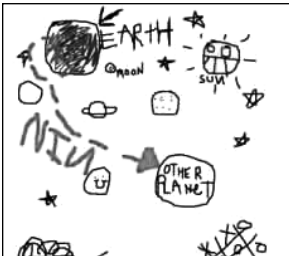
Scientific drawing of space probe's path

The WRETCHED-2600 unit will leave Earth, as shown on the left, and travel through our solar system while blaring the Nails at approximately 480 billion decibels (some "experts" say that sound can't travel through space; to them I say BAH). It also has a really bright flashing red light, to attract the aliens' attention. The basic concept is similar to that of the movie Message in a Bottle , starring Kevin Costner, except that it has absolutely nothing to do with that whatsoever.