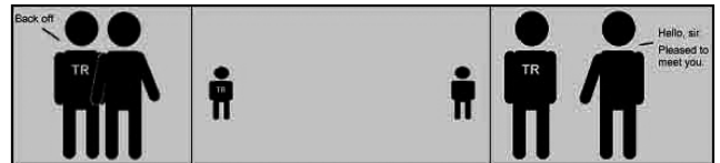
Standing too close (L); too far away (C); and the proper distance.